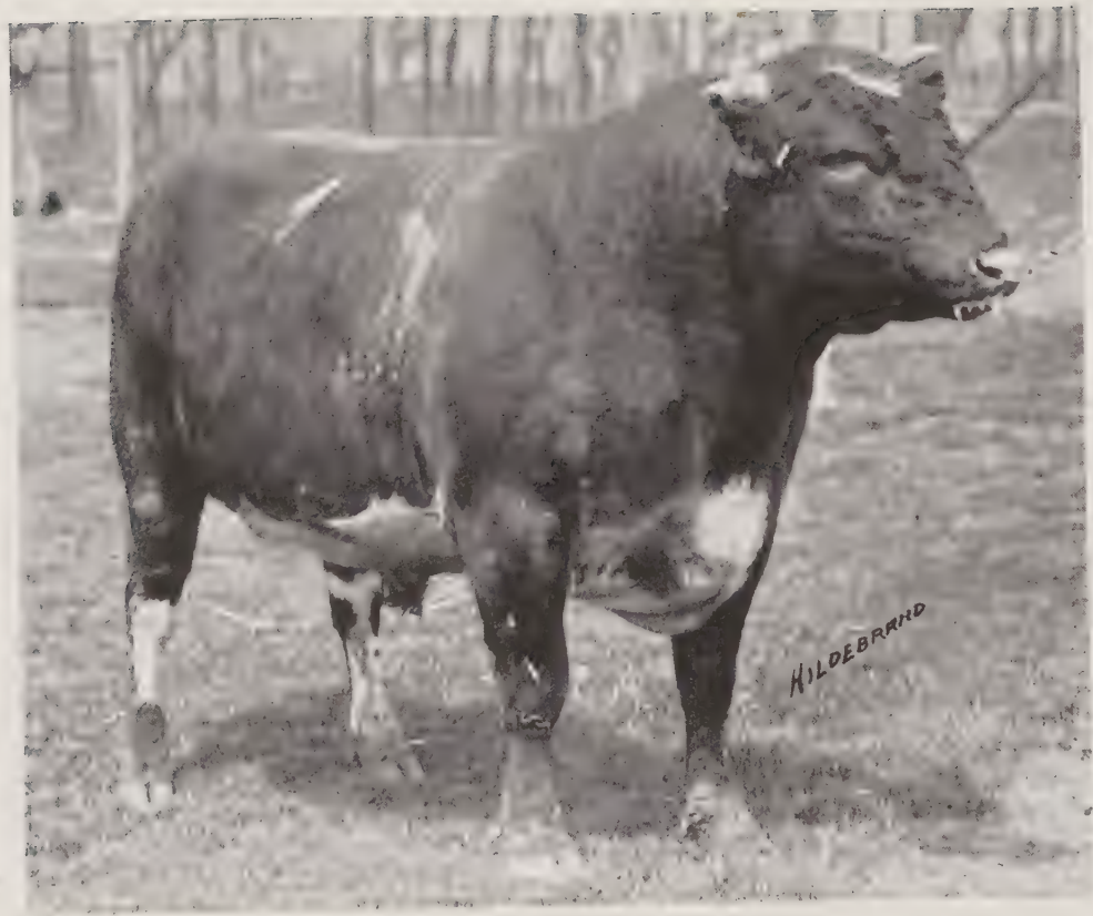
MILDRED'S SULTAN 376081.